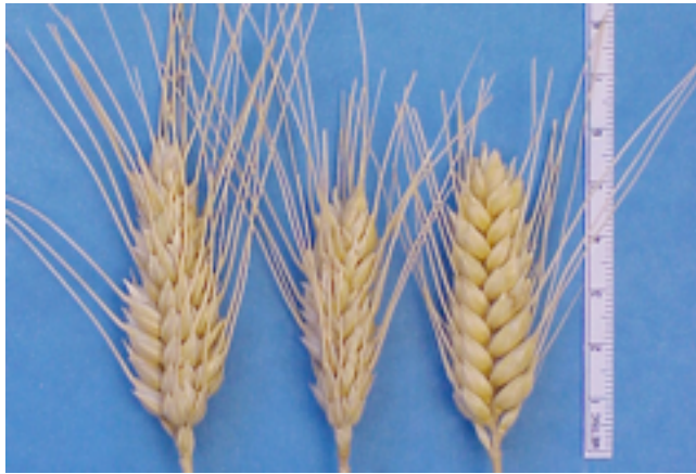
Hati - 1921, Tiberias