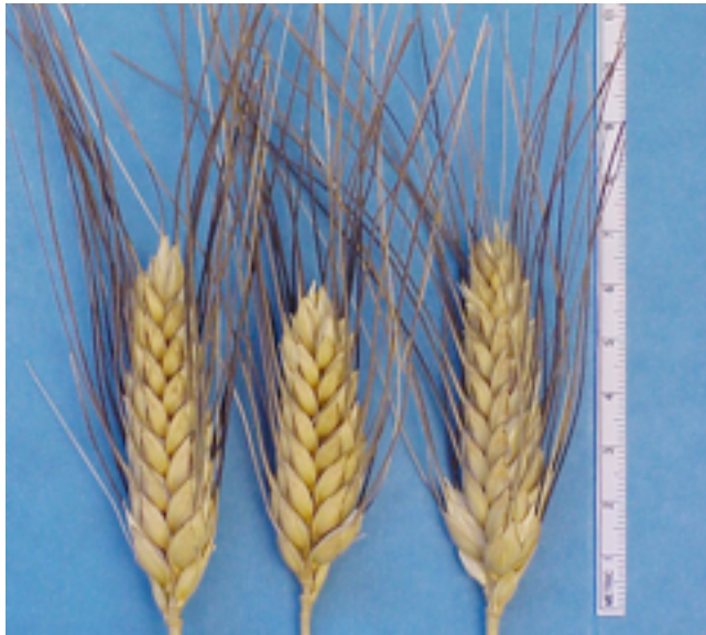
Mahmoudi, 1920, Israel Ayyelet Hashahar (Morning Star), near Waters of Meron