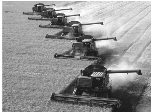
Wheat in 2000