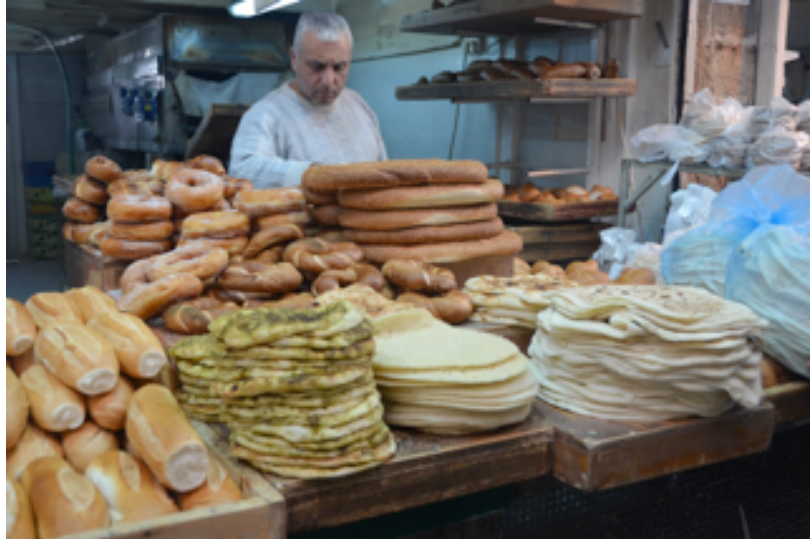
Bakery in Old City

8:30 Meet in Mamilla Lobby. Walk through the Old City to the templeinstitute.org 10 AM to learn about Temple bread traditions.