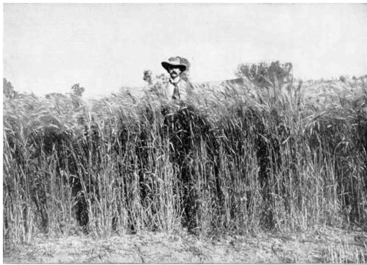
Wheat in 1900

Our goal is to conserve and revitalize the traditional arts of on-farm seed-saving, community wheat systems and landrace cuisine to restore health to the land and the people.